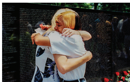
Peer-to-peer Support Provides Comfort, Care and Healing