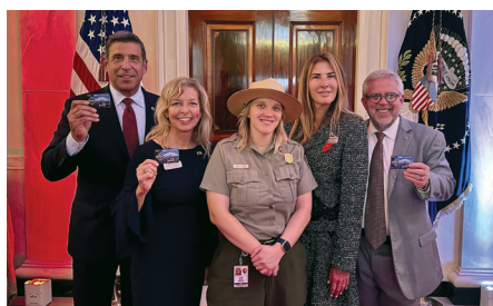
Gold Star Families receive Lifetime Pass for free access to National Parks